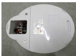
Bottom of water kettle when removed from base