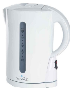
Rival Brand Water Kettle, WK8283CU and WK8283CUI

To report a dangerous product or a product-related injury go online to www.SaferProducts.gov or call CPSC's Hotline at 800-638-2772 or teletypewriter at 301-595-7054 for the hearing impaired. Consumers can obtain news release and recall information at www.cpsc.gov , on Twitter @USCPSC or by subscribing to CPSC's free e-mail newsletters .